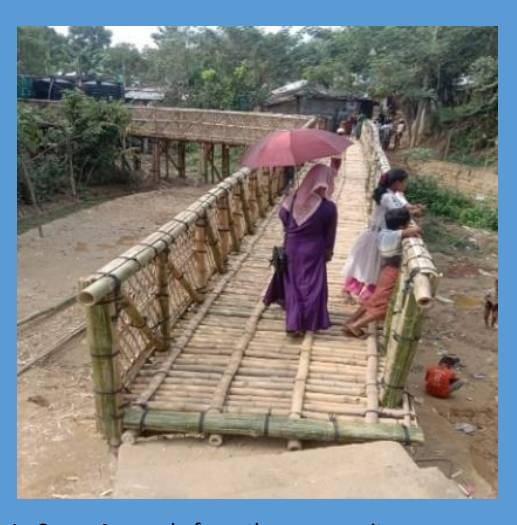
In Camp 4, people from the community can now freely and safely walk across the bamboo bridge.