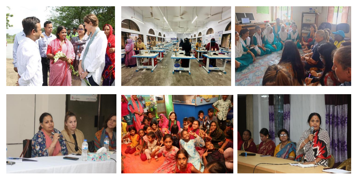
(Clockwise from the top left) The UN Resident Coordinator engaging with women farmers supported by FAO in Khulna; The delegation met the students at Khulna Mohila Polytechnic Institute (KMPI) supported by ILO; Adolescent girls from Botolbunia school in Borishal supported by UNFPA, sharing their dreams and aspirations; Women CSO leaders sharing their experience in combatting climate change in Khulna; Children from UNICEF's Community-Based Child Protection Hub with the delegation in Khulna; UN Women Country Representative sharing her remarks during an exchange with service providers working to prevent GBV during the Gender Mission.

DEVELOPMENT PARTNERS AND UN VISIT TO KHULNA AND BARISAL HIGHLIGHTS THE NEED TO ACCELERATE GENDER EQUALITY