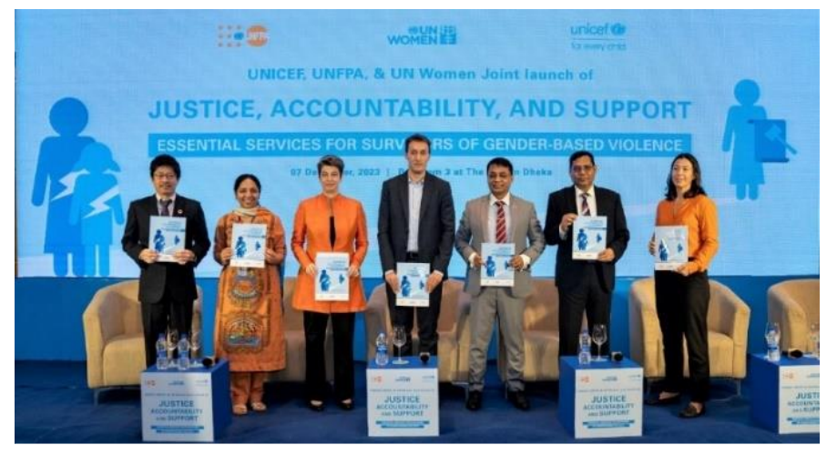
'Justice Accountability and Support: Essential Services for Survivors of Gender-Based Violence' Report Launch.

the delivery of essential services to survivors. A crucial recommendation underscores the importance of providing survivor-centred and trauma-informed services. This approach is instrumental in empowering