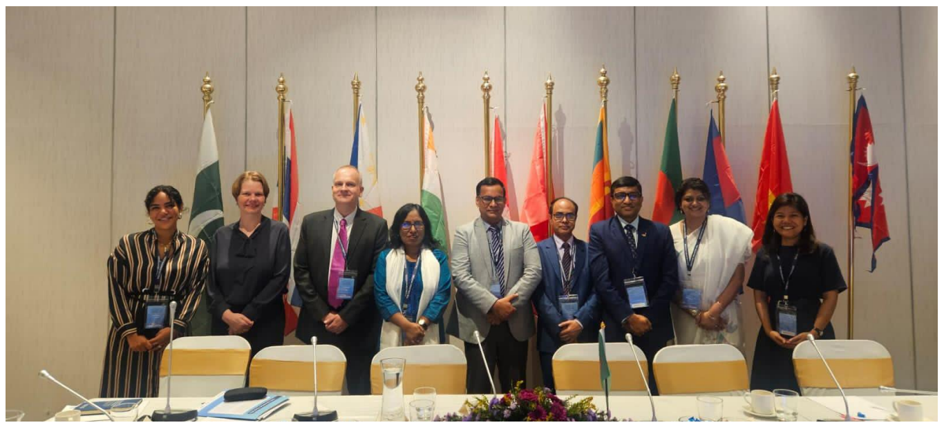
UN Women staff from Bangladesh and the Asia Pacific and the delegation from Bangladesh Government at the TAWG meeting in Colombo.

ADVANCING MIGRANT WORKERS RIGHTS AND EMPOWERMENT: PROGRESS AND FUTURE INITIATIVES IN THE COLOMBO PROCESS