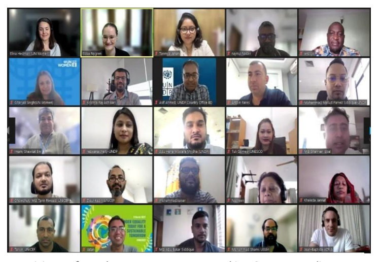
Participants from the UN Procurement Working Group attending an online training session on gender-responsive procurement system in November 2023.

Building on that momentum, in 2023 the Procurement Working Group, with support from UN Women, organized a training to increase internal capacity on the technical aspects of a GRP system. A total of 39 procurement and operations staff from around 10 UN agencies attended the session. The purpose of the