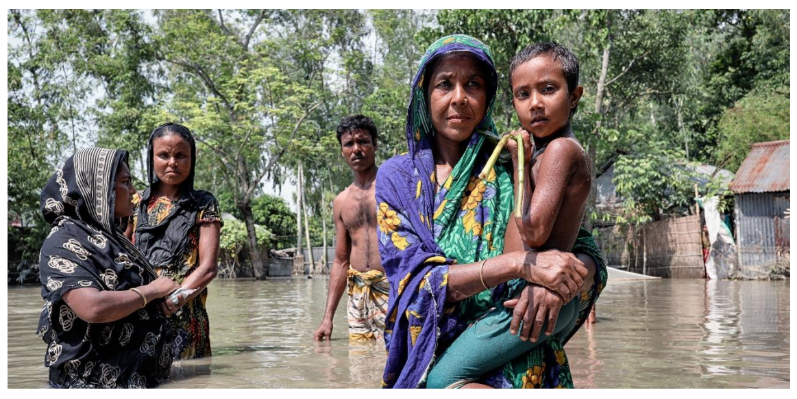
Women and children during disasters.

This year, the Government of Bangladesh adopted the updated Climate Change and Gender Action Plan (ccGAP) following its review and approval by the Ministry of Environment, Forest and Climate Change (MoEFCC). The updated ccGAP provides numerous measures to ensure women's empowered leadership and participation in national and local actions to address climate change. The original ccGAP was first adopted ten years ago. The updated Plan is designed to address the distinct challenges faced by women in coping and building beyond the onslaught of climate change crises. Limited access to information and resources, such as finance, expertise and technology have increased women's vulnerability to disasters spurred by climate change. In response, the updated ccGAP identifies targeted interventions in the areas of natural resources, livelihoods, infrastructure, women's leadership, gender perspective in implementation, capacity building, knowledge management, and communication. The ccGAP is aligned with SDG 5 (gender) and 13 (climate change) and serves as a vehicle to accelerate the implementation of the gender component of the National Adaptation Plan (2023-2050). UN Women ensured women's voice and representation in the development of the Plan by enabling their effective participation. In particular, UN Women provided