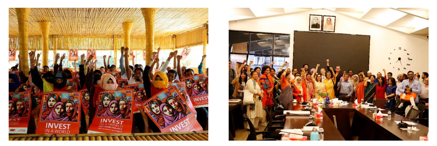
Launch of 16 Days of Activism to end GBV in Cox's Bazar.