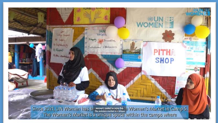
A screenshot of the video

The Women's Market strives to support the economic empowerment of women in the Rohingya camps. Watch the video .