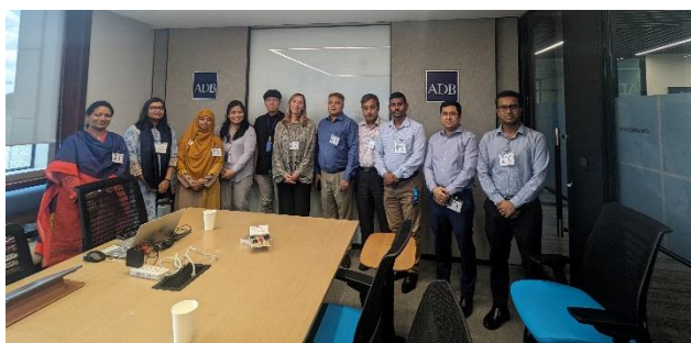
The mission team comprising of UN Women, Bangladesh Bureau of Statistics, Statistics and Informatics Division and the Asian Development Bank pose for a group photo.