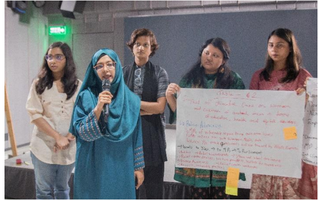
(Left) Group photo of the participants, facilitators and organizers after the dialogue; (Right) Participants sharing key advocacy messages developed from the group work during the session.

“The Breaking Barriers: Designing Equality” a youth-led workshop for gender equality was held in Dhaka in June by the Swedish Embassy, UN Women, Manusher Jonne Foundation and Bangladesh Mahila Parishad. Prior to these, two similar workshops were conducted in Barishal and Kurigram. It provided a space for representatives of youth associations, organizations, and activists to come together, exchange ideas, and collaborate on initiatives aimed at advancing gender equality. Participants were also introduced to the concept of design thinking as a methodology for problem-