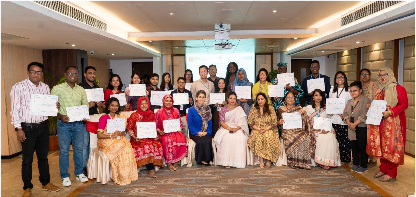
Group photo of the participants and organizers after completion of the three-day long RGA training.

A total of 24 humanitarian practitioners from diverse organizations, including UN agencies, INGOs, NGOs, and government officials, gained crucial skills for conducting rapid gender analysis through a three-day Rapid Gender Analysis (RGA) training in April. In a significant step towards enhancing gender-responsive humanitarian efforts, the Inter-Cluster Gender in Humanitarian Action Working Group (GiHA) Bangladesh, led by the Department of Women's Affairs and co-chaired by UN Women, hosted the training.