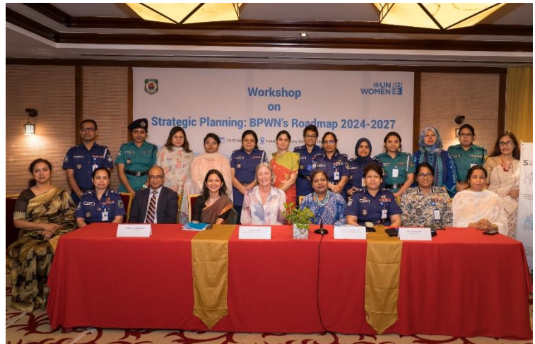
Group photo of BPWN members and UN Women team after the Strategic Planning Workshop.

The Bangladesh Police Women Network (BPWN) reviewed its final annual performance plan under the Strategic Plan (2021-2023) and developed the next phase of its strategic plan (2024-2027) with technical support from UN Women. The President of BPWN pledged to commit to and promote the five Global Gender-Responsive Policing Principles. The strategic plan was finalized in a workshop titled “Finalization of Strategic Plan: BPWN’s Roadmap 2024-2027” where 23 police officers (20 women, 3 men) from BPWN and different other units of Bangladesh police such as, police headquarters, criminal investigation department and Dhaka metropolitan police were present. BPWN members will develop a work plan to implement the strategic plan and present it to the Inspector General in July 2024.