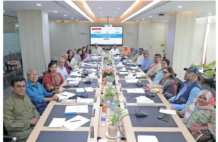
Participants at the roundtable dialogue in Prothom Alo office.

Find the full supplement in Bangla: প্রতিবন্ধী নারীর সুরক্ষায় আইনি কাঠামো: চ্যালেঞ্জ ও করণীয় ; প্রতিবন্ধী নারীর উন্নয়নে চাই অগ্রাধিকার.