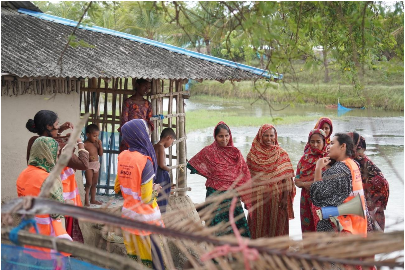
Local partners of GiHA are quickly mobilized to collect information and data, ensuring a comprehensive and timely analysis of the cyclone's impacts on women, girls, and vulnerable populations.

Food and Income: Short-term recommendation included distribution of food packages with utensils and fuel wood, Cash-for-Work programs, livelihood training and cash assistance and lifting the fishing ban in affected districts. The long-term recommendations focused on providing resilient livelihood skills training, creating provisions for interest-free or low-interest loans to women and FHHs, exploring alternative livelihoods, and ensuring support for the development of women-friendly market systems.