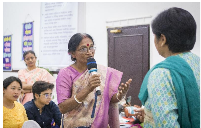
(Left photo) Young women leaders presenting the need to promote gender-sensitive content on social media platforms and raising awareness on cyber security issues; (Right photo) A veteran woman leader from Bangladesh Mahila Parishad (BMP) highlighting the need for mapping and listing of destitute/homeless people with disabilities to ensure their safety and provide special healthcare services.