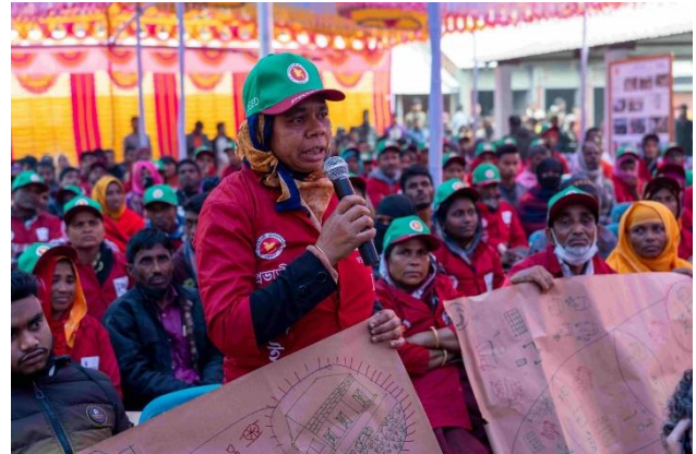
Community members sharing insights on the importance of early warning system in reducing losses caused by floods in their area with the UN team in Kurigram.

In January, the UN Resident Coordinator, in collaboration with UN Women, led a mission for the Rome-based UN agencies (RBA) FAO, IFAD, and WFP, to visit Rangpur and Kurigram. The mission explored innovative ways to better support women through existing food security, nutrition, sustainable agriculture, and climate change adaptation programmes.