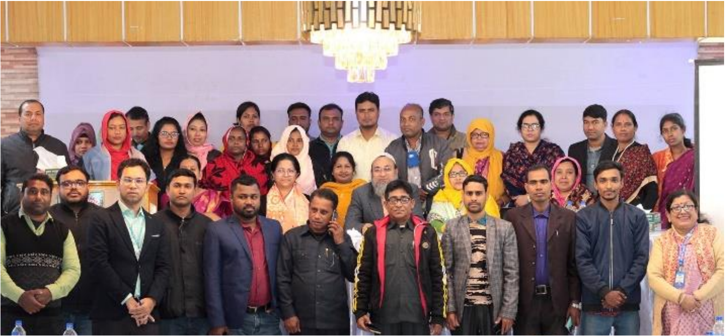
(Left) Group photo of local government representatives, women-led civil society organizations, local journalists and UN Women representatives at the Satkhira GiHA Working Group chapter launch on 12 February 2024.

UN Women continues to expand its efforts in strengthening women's leadership and voices in humanitarian response across the country. Recently, two new local chapters of the Inter-Cluster Gender in Humanitarian Action (GIHA) Working Group were launched in Khulna and Satkhira districts after establishing the first local chapter in Kurigram last year.