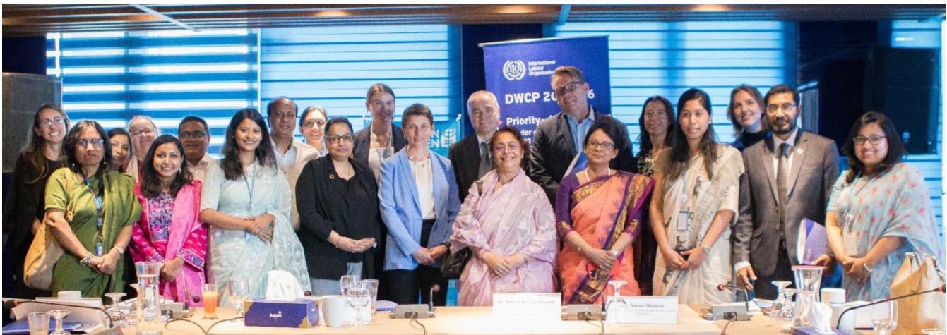
The hon. state minister and secretary of MoWCA with the UNRC, representatives from development partners, UN Women and ILO after an engaging conversation on the importance of investing in care economy. Photo: UN Women/Monon Muntaka.

Under the leadership of MoWCA and in collaboration with ILO, UN Women organized a dialogue with development partners on “Transforming the Care Economy in Bangladesh” to increase investments in the care economy. This