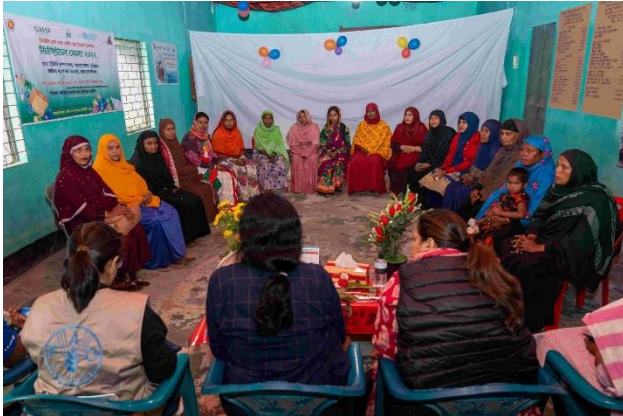
Women farmers in Rangpur sharing their experience with the UN team on how UN support has helped them to access resources and grow their businesses.