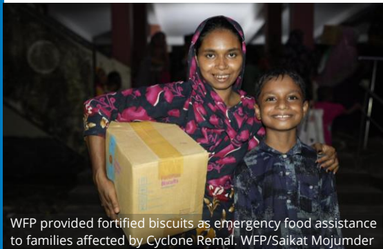
WFP provided fortified biscuits as emergency food assistance to families affected by Cyclone Remal.