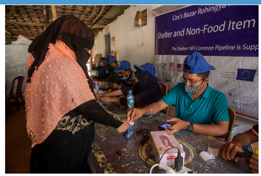
Photo: A Rohingya woman uses a SCOPE card to access shelter and non-food items.

More than three weeks after a devastating fire broke out in three Rohingya refugee camps in Ukhiya, Cox's Bazar on 22 March 2021, aid agencies and the Government of Bangladesh continue to work together to meet the immediate needs of the 48,300 individuals who lost their homes and personal belongings.