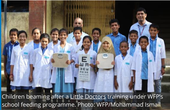
Children beaming after a Little Doctors training under WFP's school feeding programme.

WFP started operations in Bangladesh in 1974. While significant economic growth was witnessed in the past decade, nearly one-third of the population still face food insecurity and 20 percent live below the national poverty line. Bangladesh is extremely vulnerable to natural hazards with most of the population residing in areas prone to floods and cyclones. The country strategic plan 2022-2026 reinforces WFP's commitment to working with the Government to improve food security, nutrition, and resilience of vulnerable communities, while also providing emergency assistance to people affected by disasters.